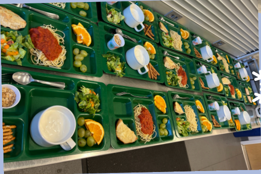
Spagetti and Meatballs