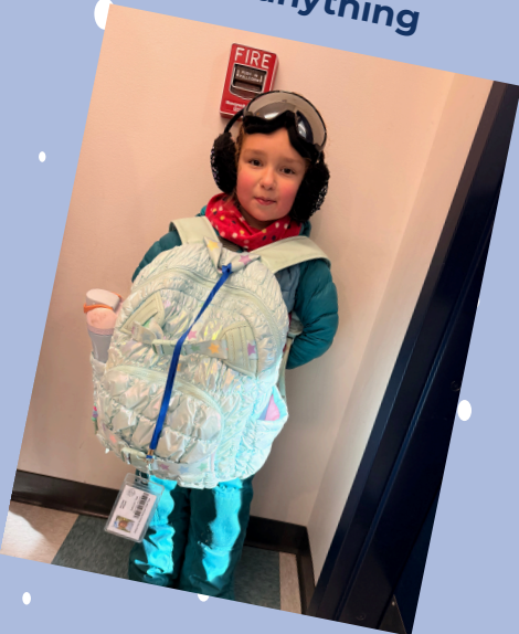
Students prepared for anything